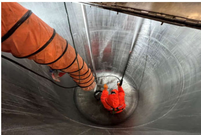
Flush dirt by waterjet ウォータージェットで汚れを流して仕上げ