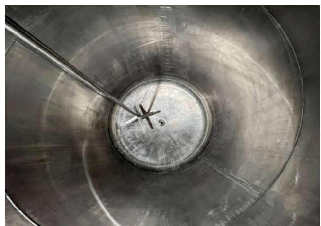
Inside the tank after cleaning 清掃後