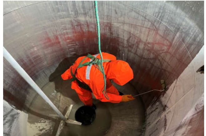
Coat gel acid ジェルアシッド塗布