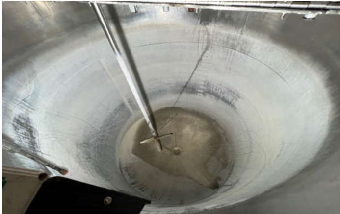
Inside the tank before cleaning 清掃前